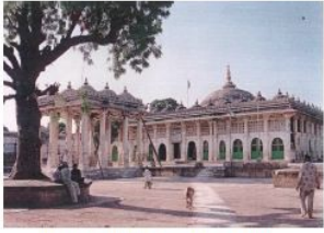
Pavilion and saints tomb