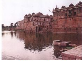
Royal tombs and water tank