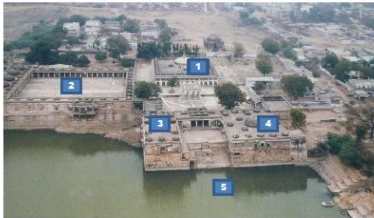
Bird's eye view of Sarkhej Roza

To go into the complex it is necessary to remove your footwear - also particularly women should be reasonably dressed i.e. no shorts or low cut tops etc. Footwear left at the entrance is placed in a box and watched over - on return a small donation of around 20 or 30 Rupees is expected. Within the Tomb and Mosque area there are several donation boxes around but feeding them is not compulsory. The actual Mosque itself is closed between 12:00 and 14:00 hours each day as well as possibly for a short time during Prayers.