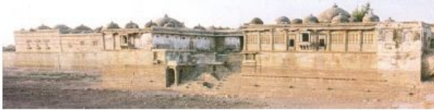
SARKHEJ ROZA MOSQUE